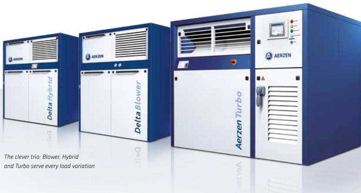
The clever trio: Blower, Hybrid and Turbo serve every load variation