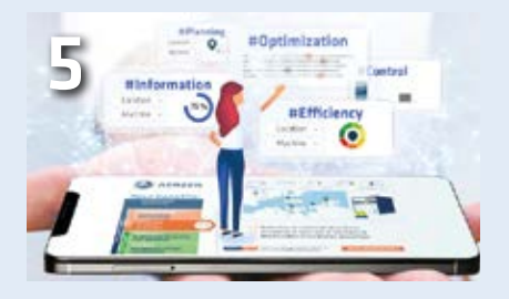
Digital control technology AERtronic newly developed

AERprogress Added value through digitisation