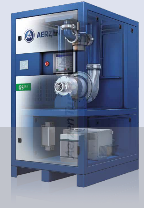
Aerzen Turbo G5plus is the most compact and efficient turbo machine of its class.

coating, maximum reliability, even under extreme operating conditions.